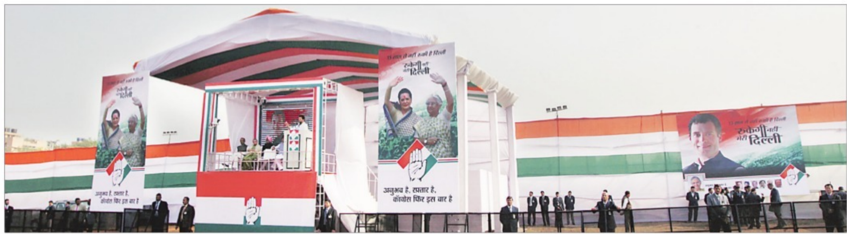
Rahul Gandhi addresses a rally at Ambedkar Nagar before the Assembly elections last year.